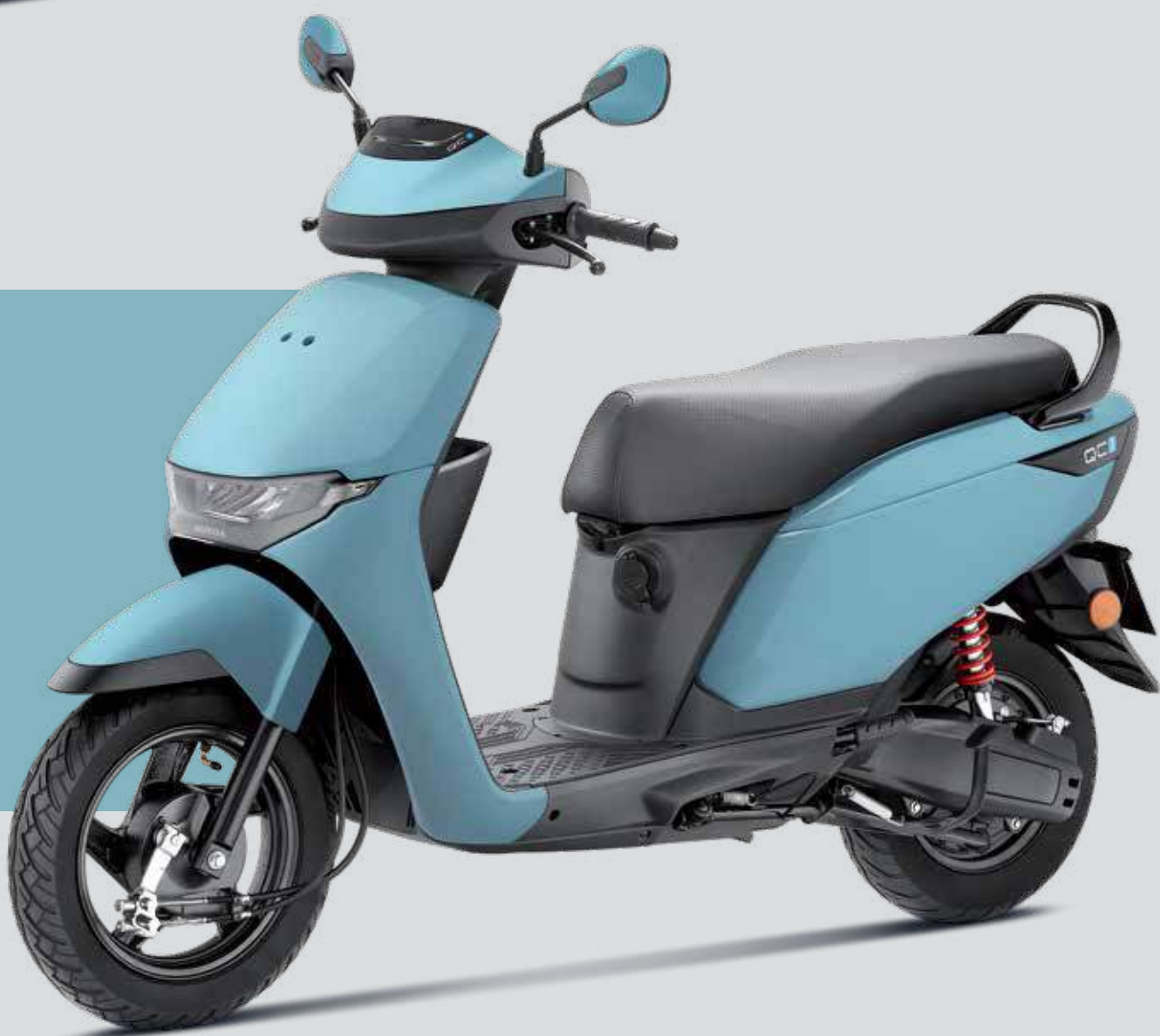
Pearl Shallow Blue